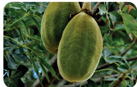
Baobab ( Adansonia digitata )

South Africa is one of the most biologically diverse countries in the world, with more than 21,000 plant species, many of them endemic. It has emerging biotrade value chains of economic importance for southern Africa.