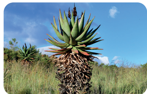
Aloe ( Aloe ferox )