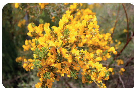
Honeybush ( Cyclopia )