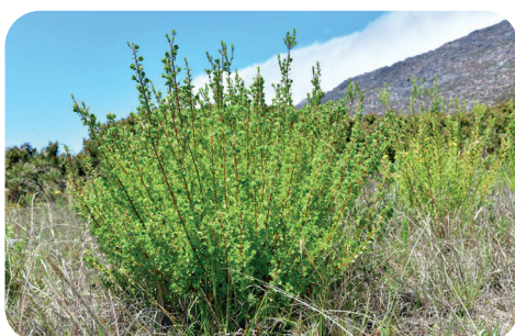
Buchu ( Agathosma spp. )