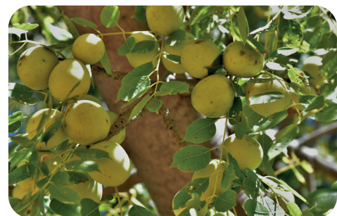
Marula ( Sclerocarya birrea subsp. caffra )